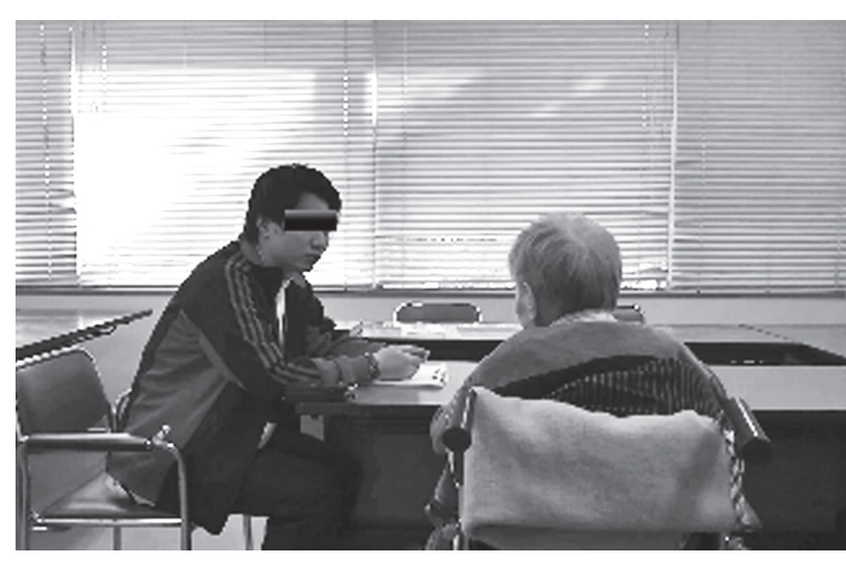
Figure 2. Segment shot of a free conversation

In free conversation, the number of abstract words expressed was lower than that of concrete words in all subjects. In addition, the MMSE scores and the number of abstract words expressed were proportional, with a higher MMSE score being associated with a higher number of abstract words expressed in the conversation. The results suggest that when a higher cognitive function is maintained, words that are more abstract can be expressed.